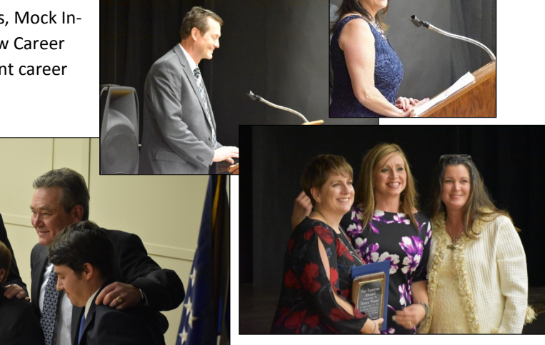
Congratulations, Award Winners!