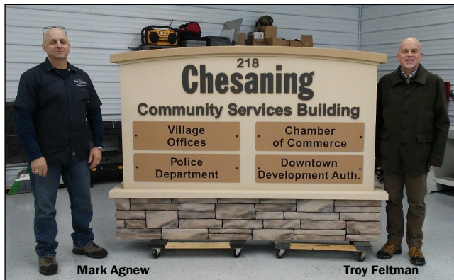
A visit to Agnew Graphics' new location at 1905 W. M-21 in Owosso gave us a sneak peek at the new Community Services Building monument sign!