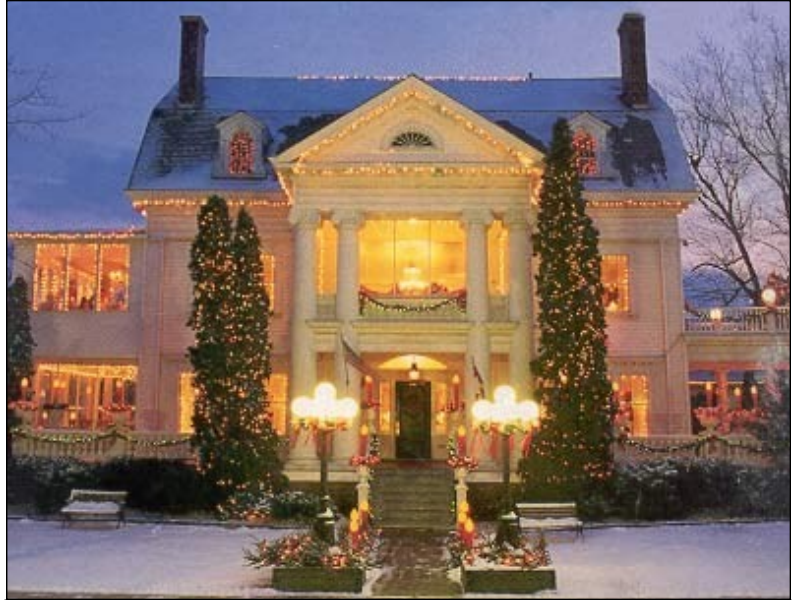
"A shot of the Heritage House at Christmas when it was still in operation (pre-2007)"

I had many great times at the Rathskeller and good meals upstairs, but I will always remember a picture of my youngest daughter, Brandi, and her girl scout troop on the