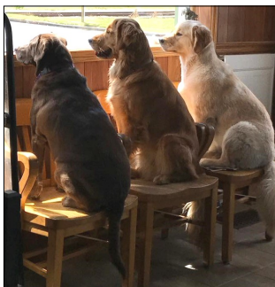
The Swartzmiller greeting committee is always eager to welcome customers!