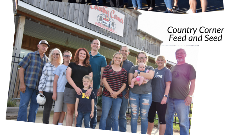
Country Corner Feed and Seed