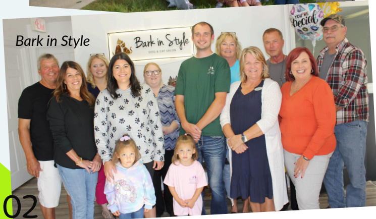
Bark in Style