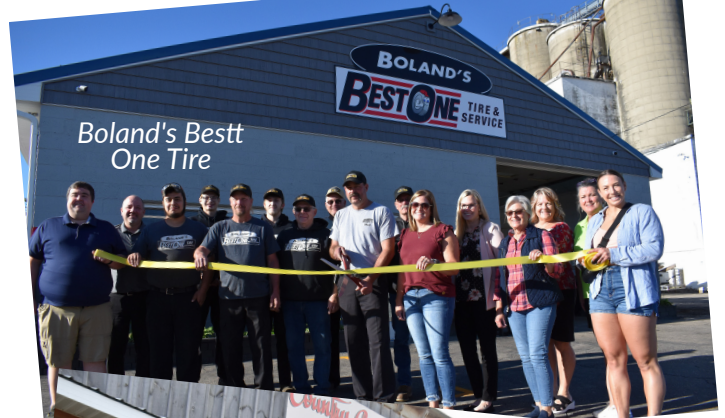
Boland's Best One Tire